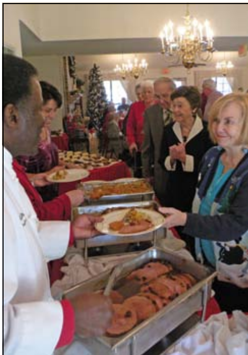
Residents and their guests enjoyed a delightful meal at their annual Christmas celebration in the Endahl Residence.

Even though it appeared that most people were relatively satisfied with their dining experience it was important to evaluate how meals were served, what menus were available at each meal, what dining times were available, etc. When the discussion began it was obvious that help was needed in making the assessments and making improvements.