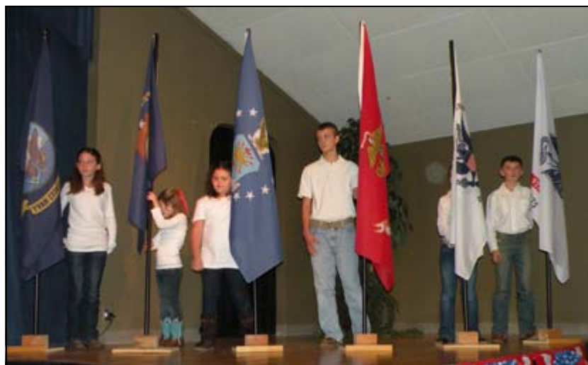
Area children participated in the Veterans program by serving as the flag corps.