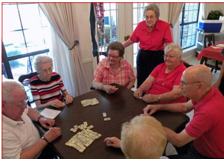
Residents of Rainbow Retirement Community spent a cool afternoon playing games and enjoying one another's company in celebration of America's independence on the 4th of July.